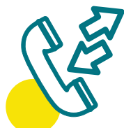
Improved Connection Time