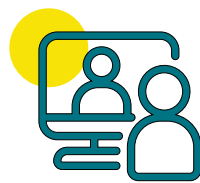
Video Remote Interpretation