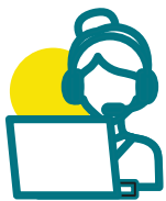
Great Customer Service