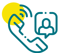
Over the Phone Interpretation